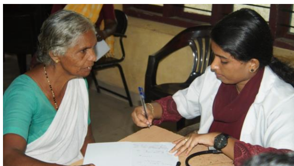
Figure 67: Participation of students from Santhigiri Medical college