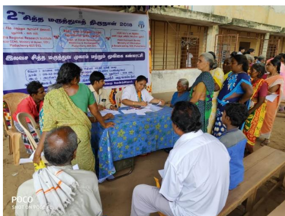
Figure 49: Consultation being provided to the patients