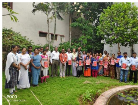
Figure 54: Participants of the Write-a-thon competition receiving the certificates