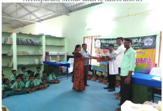
Figure 125: Medicinal tree saplings gifted to be planted in the premises of Union Primary School, Neethipuram