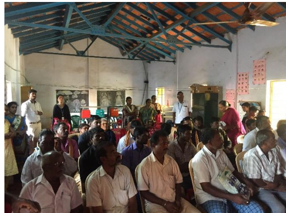
Figure 20: Section of the audience who participated in the Special Siddha day medical camp at Ellamman Pettai