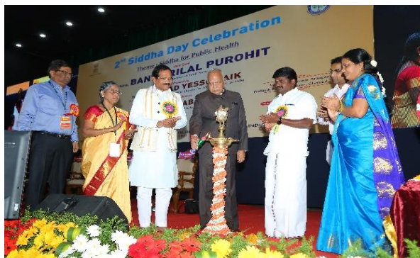
Figure 1: Lighting of Lamp by Shri Banwarilal Purohit, Governor of Tamil Nadu