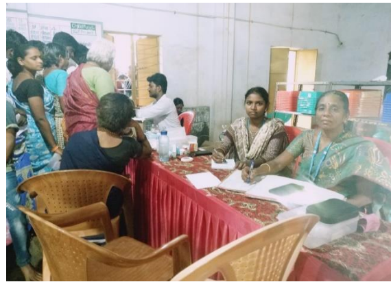
Figure 32: Distribution of medicines in the medical camp