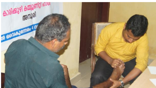
Figure 65: Varmam Therapy provided in the medical camp