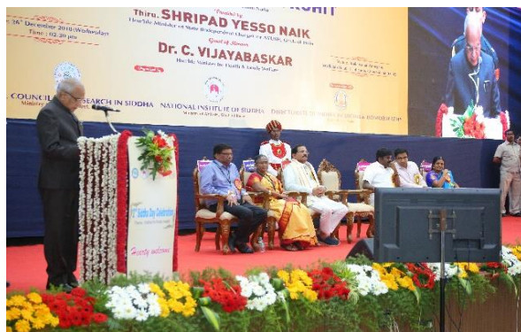
Figure 4: Chief Guest address by Shri Banwarilal Purohit, Governor of Tamil Nadu

Shri Banwarilal Purohit, His Excellency the Governor of Tamil Nadu inaugurated the 2 nd Siddha day celebration and in his chief guest address, highlighted the need of the hour is to return to our roots and imbibe the age old, time tested Traditional Medicine in our day to day life to live a long and healthy life. Shri Shripad Yesso Naik, Hon'ble Minister of State (Independent charge), for AYUSH, the guest of honour explained the various initiatives taken by the Ministry of AYUSH in creating awareness by organizing specialized days of respective systems and showcasing their strength. Dr. C. Vijaybaskar, Hon'ble Minister for Health and Family welfare, Tamil Nadu, briefed the initiatives taken by the State machinery in implementing both the Schemes of the Central and State Governments. Dr. Senthil Kumar, IAS, Director of Indian