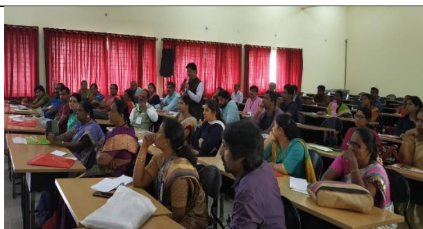
Figure 144: Section of the audience who participated in the seminar