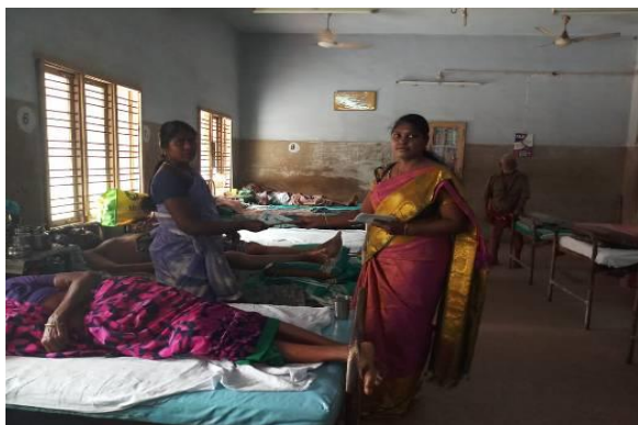
Figure 98: Distribution of pamphlets to the Inpatient of GSMC