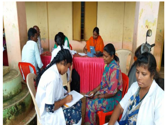
Figure 24: Participation of Students from Government Siddha Medical College, Chennai providing Consultation