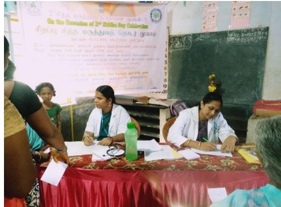
Figure 26: Consultation in the Special Siddha Day camp at Ellamman Pettai