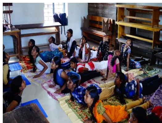
Figure 84: Yoga Training Programme was organised at Govt. Girls Higher Secondary School, Karamana

Yoga training programme at Govt. Higher Secondary School (Girls), Karamana