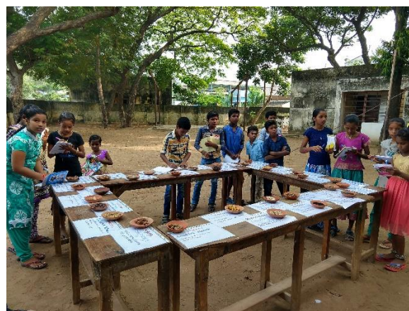
Figure 48: Exhibition for the benefit of students at the camp premises