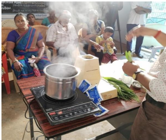
Figure 33: Demonstration of preparation of simple home remedies