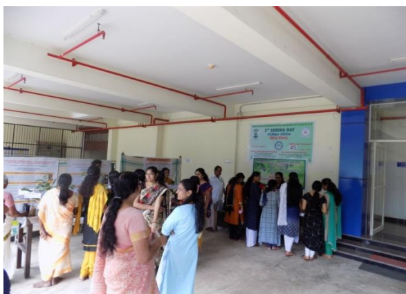
Figure 77: Visitors at Medicinal plant cum raw drug exhibition at SRRI, Thiruvananthapuram