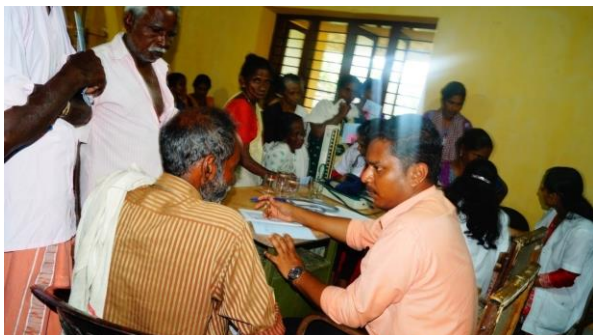
Figure 63: Siddha Consultation in progress