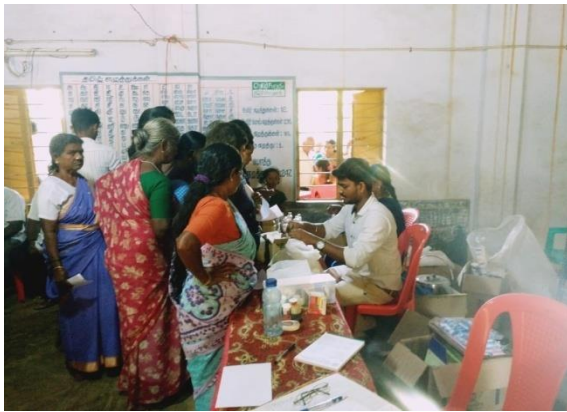
Figure 31: Distribution of medicines in the medical camp