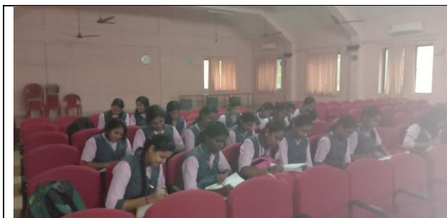
Figure 71: Competition was organised on the topic “Management of occupational disorders through Siddha System of Medicine at Lal Bahadur Shastri Institute of Technology for Women, Thiruvananthapuram