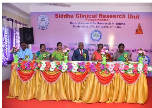
Figure 100: View of dignitaries on the dias