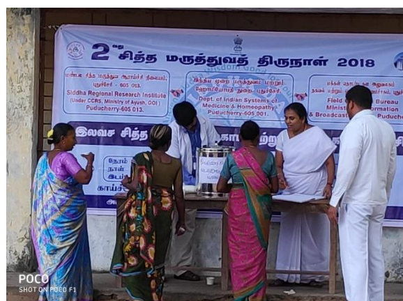
Figure 50: Distribution of Nilavembu Kudineer to the public