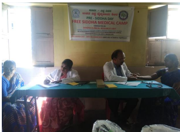
Figure 137: Free Siddha medical camps were conducted at Lakshmanapuri, Bengaluru on three consecutive days