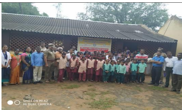
Figure 108: Beneficiaries of the medical camp