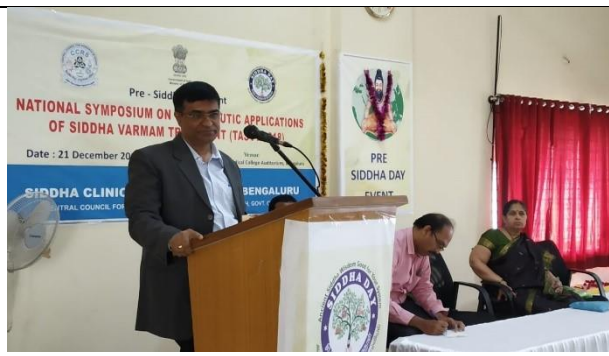
Figure 140: Dr. B.S. Sridhara, Joint Director, Department of AYUSH, Government of Karnataka delivered the inaugural address