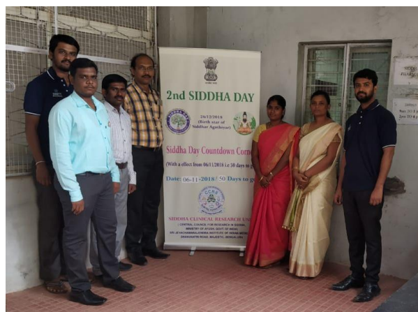
Figure 136: Siddha Clinical Research Unit, Bengaluru initiated the 50th count down day for observing the Second Siddha Day

SCRU, Bengaluru observed the 50 th day countdown of Siddha day on 6 th November, 2018. A countdown banner was fixed opposite to the Dispensary. All the Officials and staff of SCRU, Bengaluru participated in the 50 th day countdown occasion.