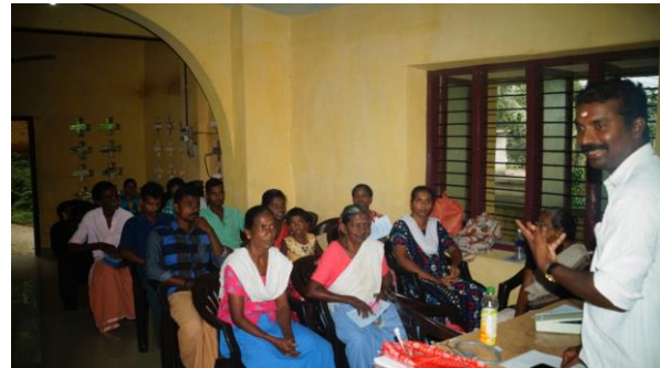
Figure 62: Inauguration of the Siddha day medical camp at Kaarikkuzhi community hall, Thodumala ward