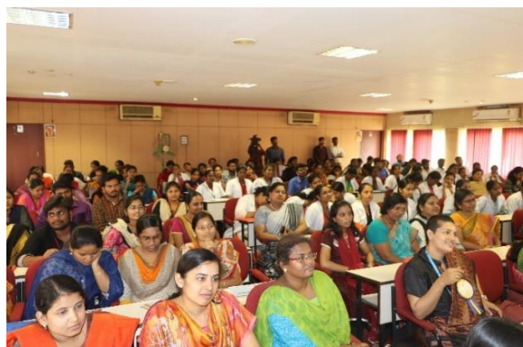
Figure 16: Inaugural ceremony of the seminar - Another section of the audience who participated in the seminar