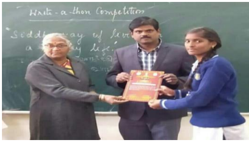
Figure 134: Write -a- thon-Siddha Essay competition conducted at DTEA School in RK Puram