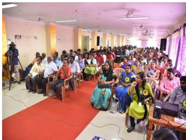
Figure 101: Audience keenly participating in the seminar