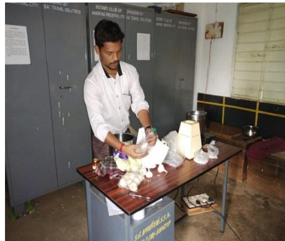
Figure 34: Demonstration of preparation of simple home remedies