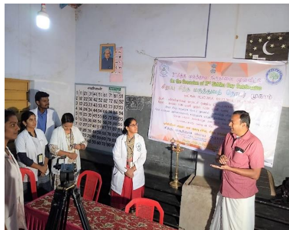
Figure 36: Public providing feedback about the camp