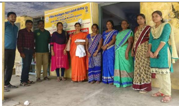
Figure 111: Third special Siddha medical camp at Agasthiyar and Servalaru Kaani tribal settlements