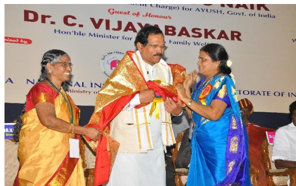
Figure 6: Prof. Dr. K. Kanakavalli, Director General, CCRS is honouring Shri Shripad Yesso Naik Hon'ble Minister of State (IC), Ministry of AYUSH