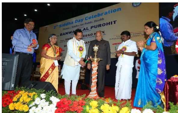
Figure 3: Lighting of Lamp by Shri Shripad Yesso Naik, Hon'ble Minister of State (Independent charge), Ministry of AYUSH