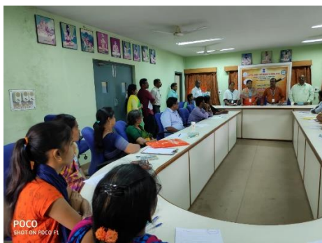
Figure 55: Write-a-thon competition prize distribution ceremony