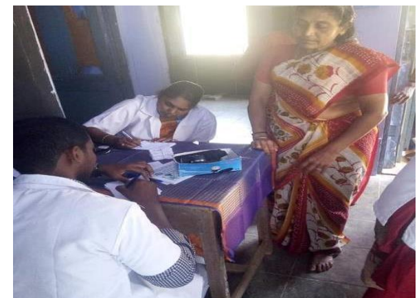
Figure 110: Doctors providing consultation to the public