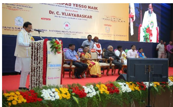
Figure 7: Special address by Guest of honour by Shri Shripad Yesso Naik, Hon'ble Minister of State (IC), Ministry of AYUSH