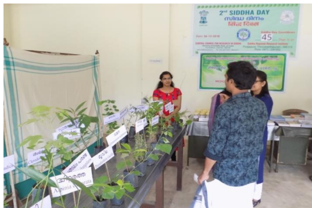
Figure 75: Medicinal plant cum raw drug exhibition at SRRI, Thiruvananthapuram

medicinal plants used in Siddha. They were very surprised to know that minerals like coral and conch are used in the Siddha formulations.