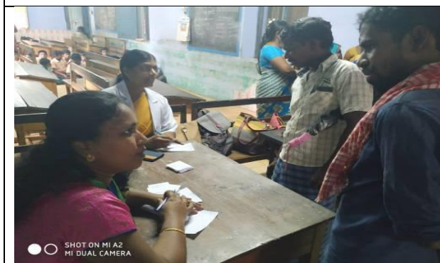
Figure 107: Doctors providing consultation to the public