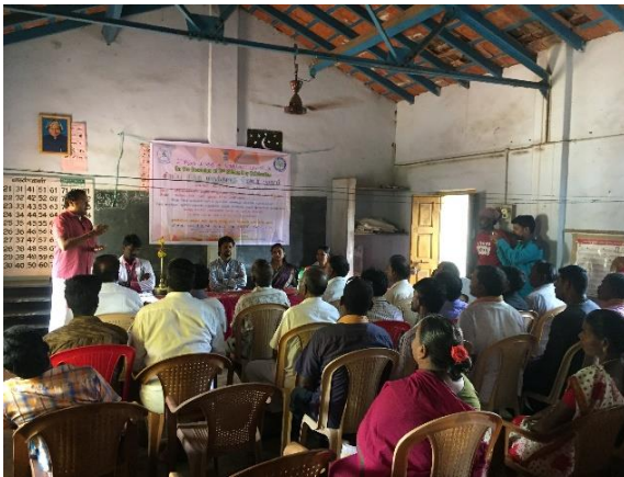
Figure 19: Section of the audience who participated in the Special Siddha day medical camp at Ellamman Pettai