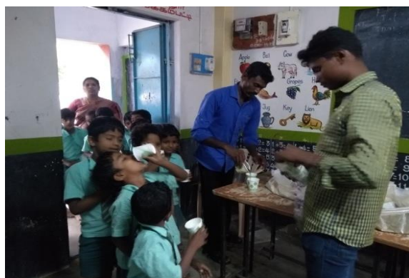
Figure 126: Nilavembu kudineer distribution to School children