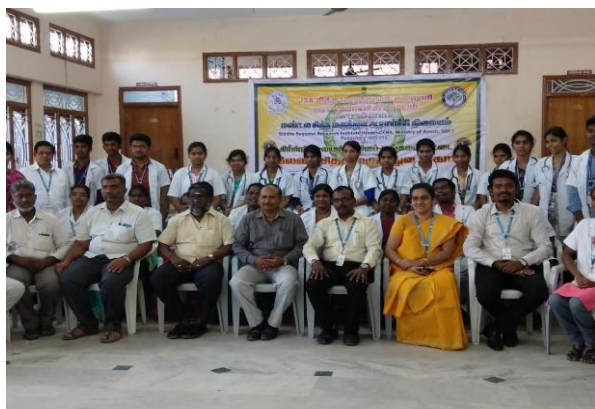
Figure 51: Free Siddha Medical awareness camp jointly conducted with JSA Siddha Medical and Research Centre, Ulundurpet