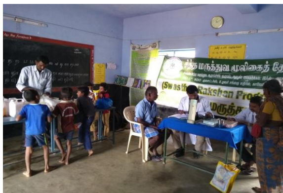
Figure 123: First free Siddha medical camp was conducted on 4th December, 2018 at Union Primary School at Neethipuram, Mettur taluk of Salem district