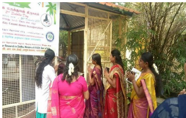
Figure 97: Initiation of 50 th day countdown day at GSMC campus

The 50 th Day countdown was observed by the staff of SCRUP Palayamkottai and Govt. Siddha Medical College (GSMC), Palayamkottai on 6 th November, 2018. IEC materials were distributed to the Inpatients and Outpatients of GSMC, Palayamkottai.