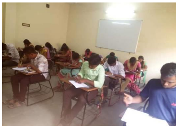
Figure 114: Participants with enthusiasm taking part in the Write-a-thon competition