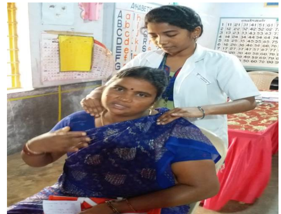
Figure 30: Varmam Therapy being provided in the Siddha medical camp at Ellamman Pettai