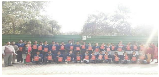
Figure 135: Participants of the Write -a- thon-Siddha Essay competition at DTEA School in Mandhir Marg