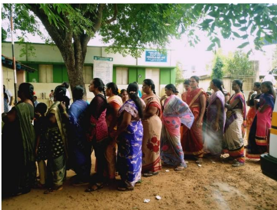
Figure 21: Queue of patients waiting at the camp