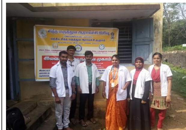
Figure 109: Participation of PG scholars and internees in the second Special Siddha medical camp