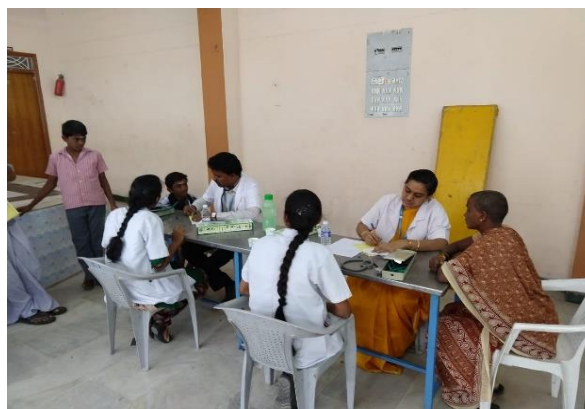
Figure 52: Siddha Consultation to the needy patients