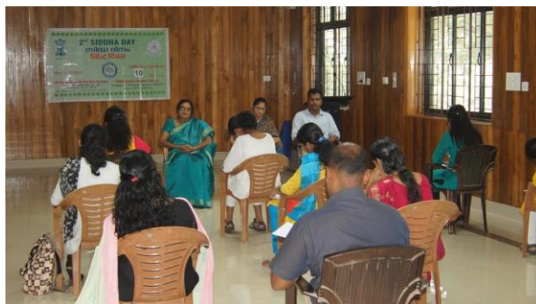
Figure 69: Write-a-thon Essay writing competition organised at SRRI, Thiruvananthapuram