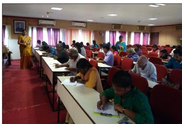
Figure 40: Participants during the Write-a-thon (Essay writing) competition