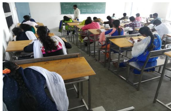
Figure 128: Section of the participants taking part in the “Write-a-Thon” competition