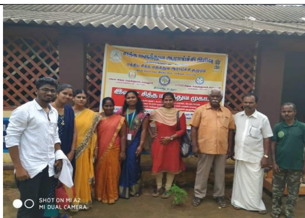
Figure 106: Team of Doctors and paramedical staff who participated in the special Siddha Medical camp