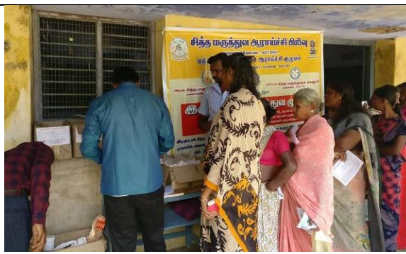
Figure 112: Patients waiting to receive the medicines at the Pharmacy