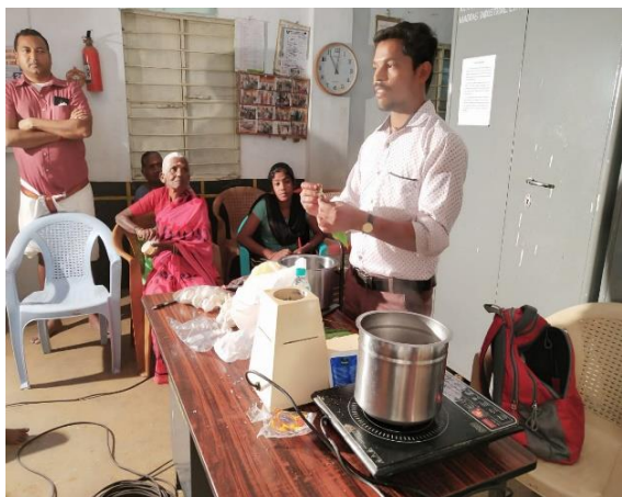
Figure 35: Demonstration of preparation of simple home remedies