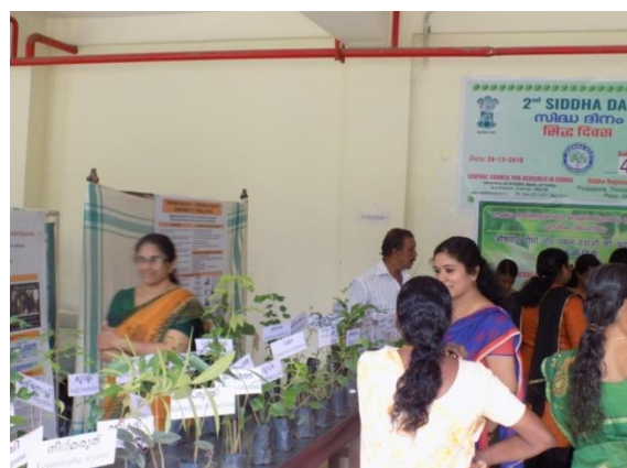
Figure 78: Another section of visitors Medicinal plant cum raw drug exhibition at SRRI, Thiruvananthapuram

Herbal exhibition at Karthika Tirunal Govt. Girls High School, Manacaud, Thiruvananthapuram.