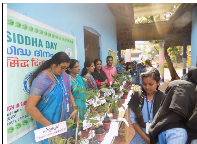
Figure 79: Herbal exhibition at Karthika Tirunal Govt. Girls High School, Manacaud, Thiruvananthapuram

Herbal exhibition at Karthika Tirunal Govt. Girls High School, Manacaud, Thiruvananthapuram.