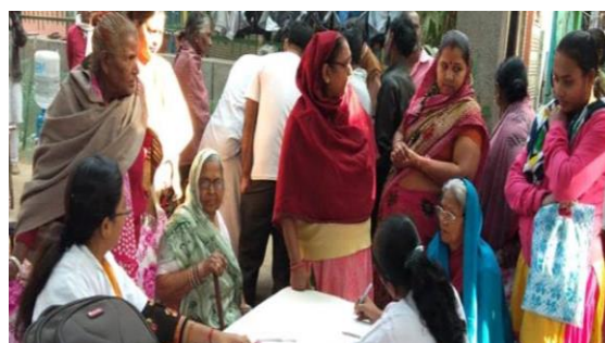
Figure 132: Siddha Day special medical camps being conducted at Inderpuri village, New Delhi