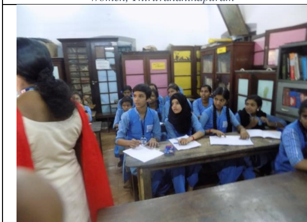
Figure 73: Essay writing competition at Karthika Tirunal Govt. Girls High School, Manacaud, Thiruvananthapuram.