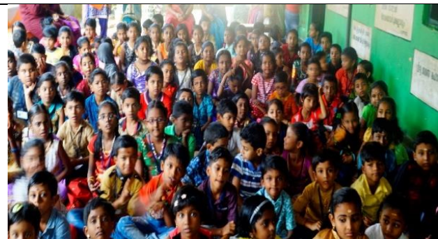
Figure 95: Section of the audience listening to the awareness lecture