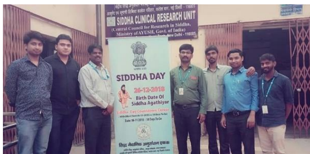
Figure 131: Siddha Clinical Research Unit, New Delhi initiated the 50th count down day for observing the Second Siddha Day

Free Siddha medical camps were conducted on three consecutive days at Inderpuri village, New Delhi. 195 patients were benefited through these camps.