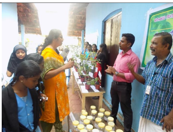
Figure 80: Another section of students at the Herbal exhibition at Karthika Tirunal Govt. Girls High School, Manacaud, Thiruvananthapuram