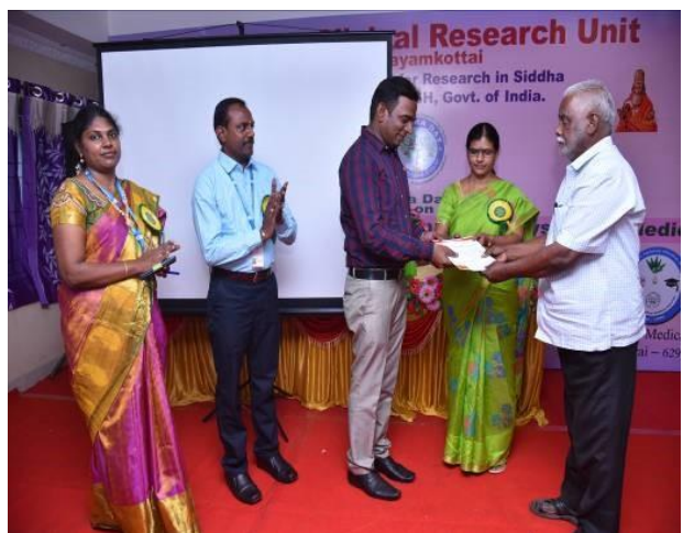
Figure 103: Students receiving the award for best Poster presentation