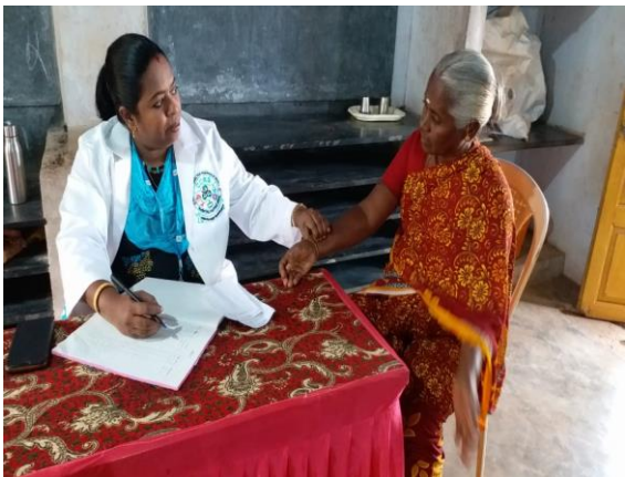
Figure 29: Consultation in the Special Siddha Day camp at Ellamman Pettai