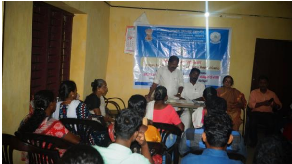
Figure 61: Inauguration of the Siddha day medical camp at Kaarikkuzhi community hall, Thodumala ward