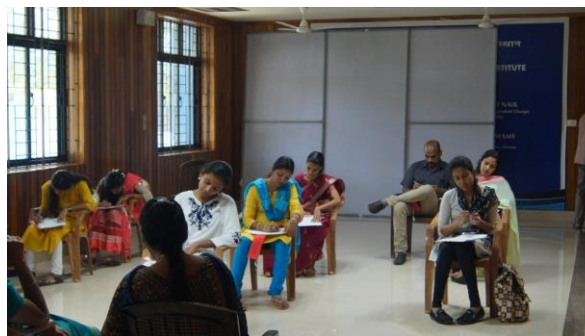
Figure 70: Write-a-thon Essay writing competition organised at SRRI, Thiruvananthapuram