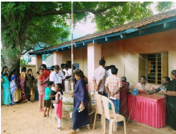
Figure 23: Consultation in progress during the Special Siddha Day medical camp at Ellamman Pettai