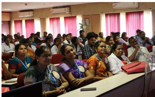
Figure 15: Inaugural ceremony of the seminar - Section of the audience who participated in the seminar

124 delegates from 6 Colleges / Institutes including National Institute of Siddha, Chennai, Govt. Siddha Medical College, Chennai, Sri Sairam Siddha Medical College and Research Centre, Chennai, Velumailu Siddha Medical College, Sriperumbudur, JSA Medical College for Siddha and Research Centre and The Tamil Nadu Dr. MGR Medical University, Guindy participated in the workshop.