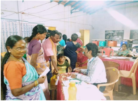
Figure 25: Consultation in the Special Siddha Day camp at Ellamman Pettai