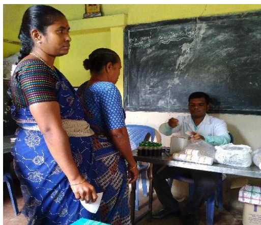
Figure 138: Patients waiting to receive the medicines at the Pharmacy