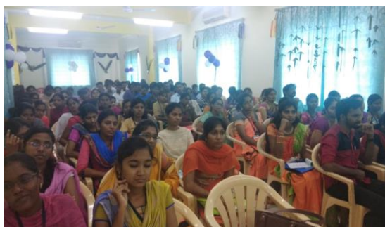
Figure 45: Section of the participants attending the SMSD Seminar