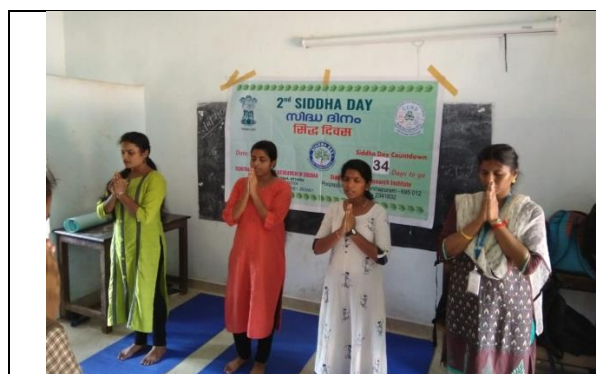
Figure 87: Prayer prior to the Yoga training programme at Govt. Higher Secondary School (Girls), Karamana