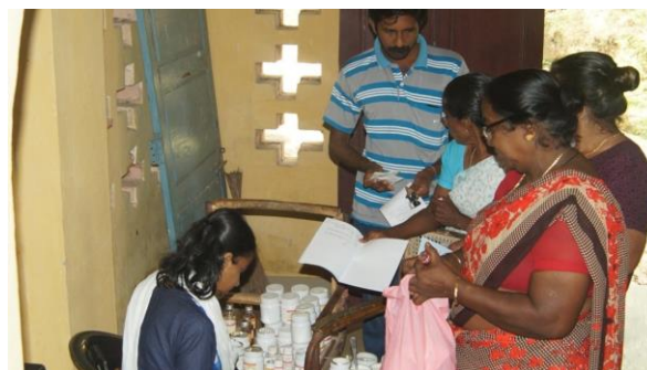
Figure 68: Dispensing medicines at the medical camp

Medical camp held on 20 th December, 2018