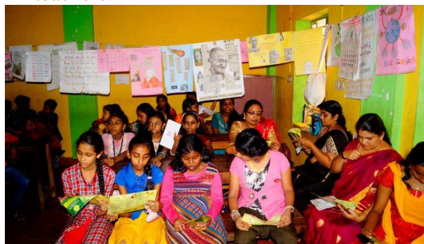
Figure 82: Pamphlets were distributed to students and teachers at Govt. Upper Primary School