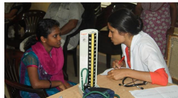
Figure 66: Participation of students from Santhigiri Medical college