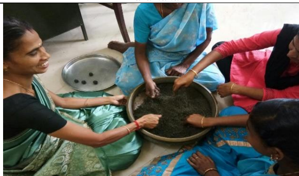
Figure 96: Nutritious Sesame Laddu (Ellu Urundai) preparation was demonstrated to the students