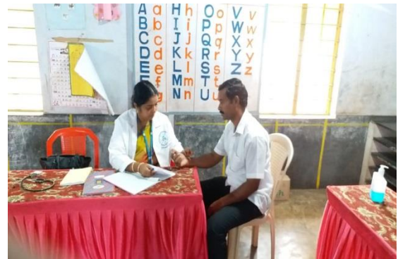
Figure 28: Consultation in the Special Siddha Day camp at Ellamman Pettai