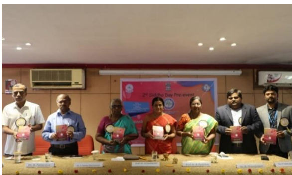
Figure 11: A Book entitled Siddha Sool and Magalir Maruthuvam was released during the inaugural session of the seminar