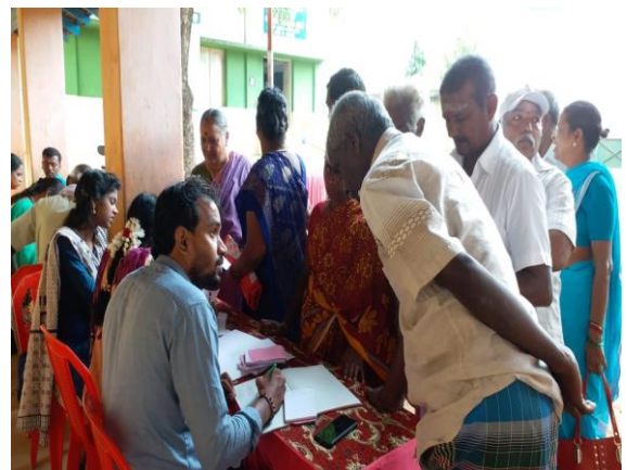
Figure 22: Registration of patients at the medical camp