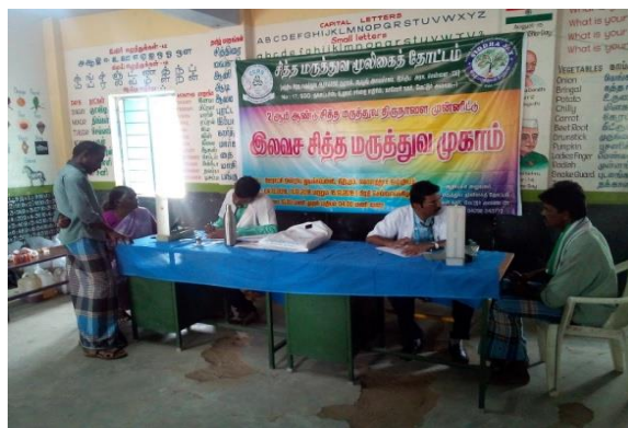
Figure 124: Siddha Consultation being provided to the general public