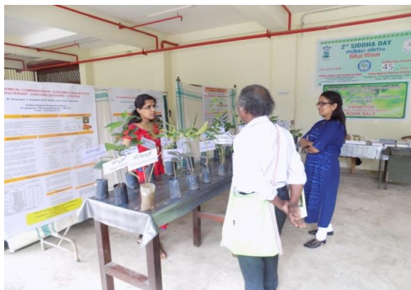
Figure 76: Medicinal plant cum raw drug exhibition at SRRI, Thiruvananthapuram