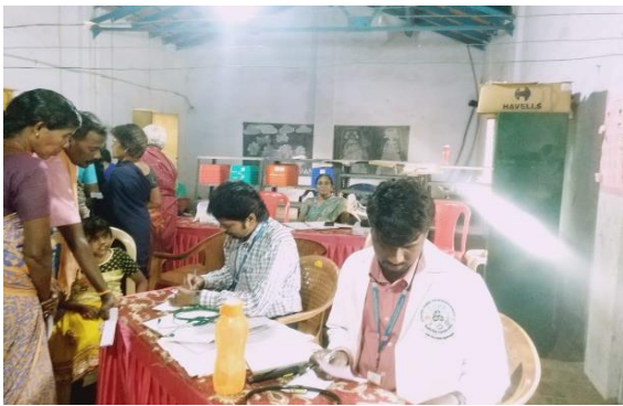
Figure 27: Consultation in the Special Siddha Day camp at Ellamman Pettai