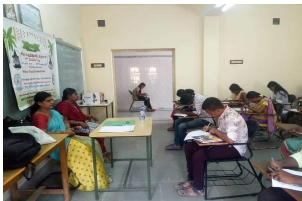
Figure 113: Write – a - thon competition was organised by Siddha Clinical Research unit at GSMC, Palayamkottai