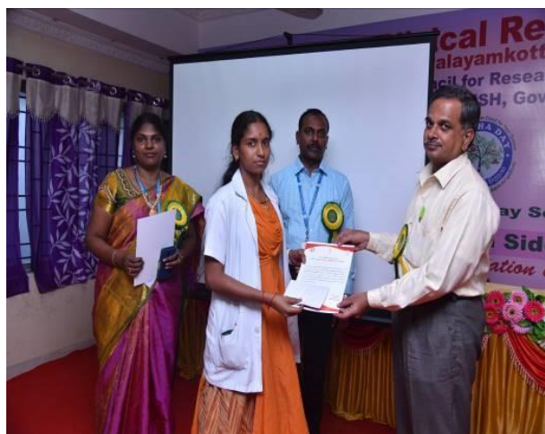
Figure 104: Students receiving the award for best Poster presentation