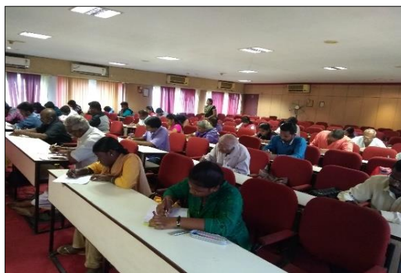
Figure 38: Write-a-thon (Essay writing) competition was conducted at Siddha Central Research Institute, Chennai