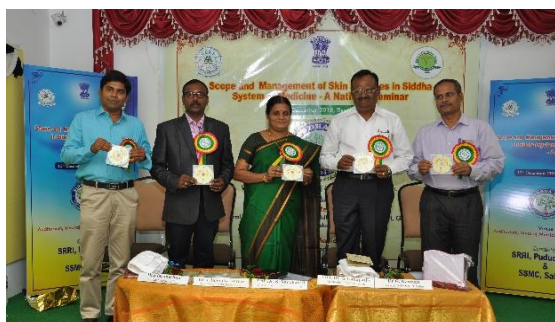
Figure 43: Release of Seminar proceedings in CD format