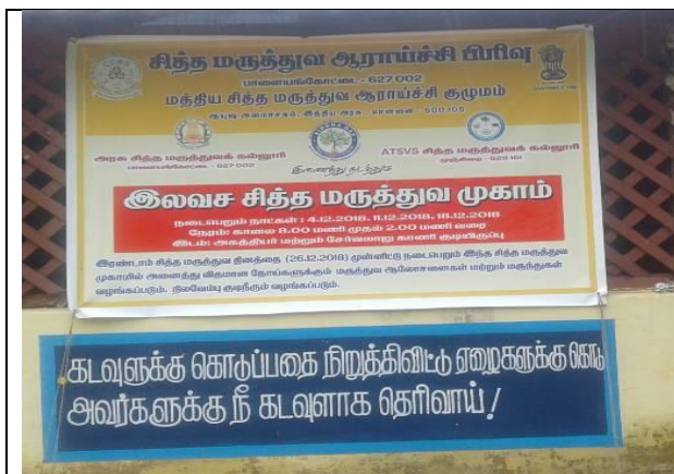
Figure 105: Banner displaying the special Siddha Medical camp at Agasthiyar and Servalaru Kaani tribal settlements