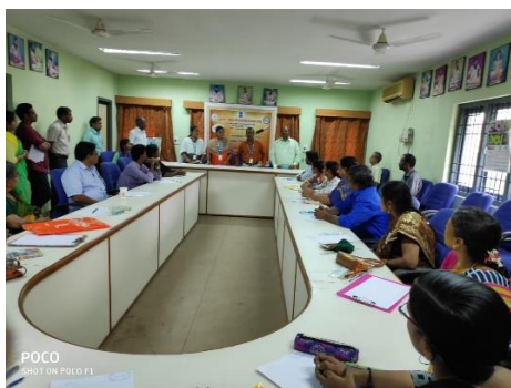
Figure 53: Write-a-thon competition as a Pre-Siddha Day event at SRRI, Puducherry